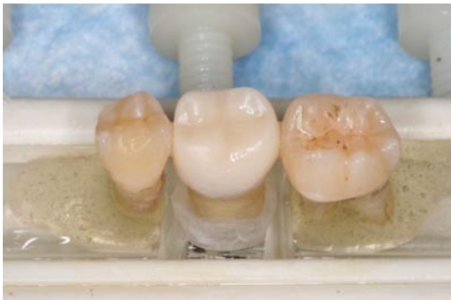
Fig. 2. Mounting sleigh for artificial row of teeth with adjacent teeth in place next to an E.max CAD crown.

maximum thickness at the gingival margins was in average 0.9 \pm 0.05 mm.