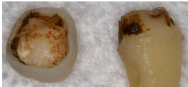
Fig. 3. ZirCAD full contour crown after laser debonding and removal. The pictures show the tooth from the mesial contact point side; No darkening of the cement at the contact points, slight darkening at the cement crown interface.

The individual removal time for the ten ZirCAD crowns varied between 210 and 501 seconds. On average, a ZirCAD full contour crown was laser debonded in 312 \pm 102 seconds.